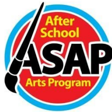
Photo Consent Form

I, (print name) _____, parent or legal guardian of (child's name) _____, hereby